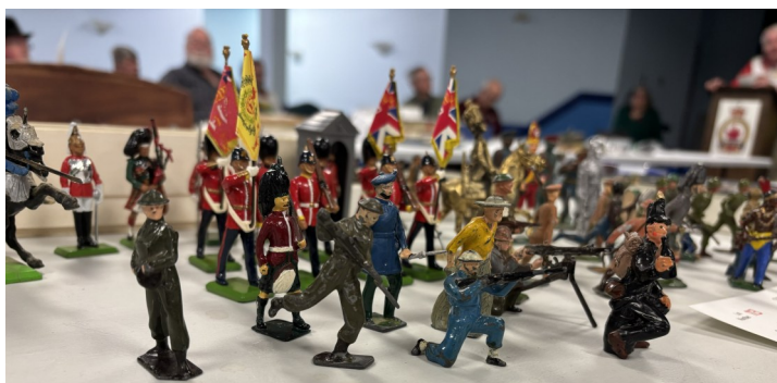
One of the many sets that were available to bid on