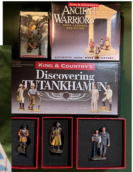
Items bought at the December meeting included some great deals on King & Country sets