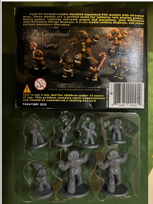
That's different—War Gaming "The Gingerbread Gang" found in a collectibles shop in Brockville